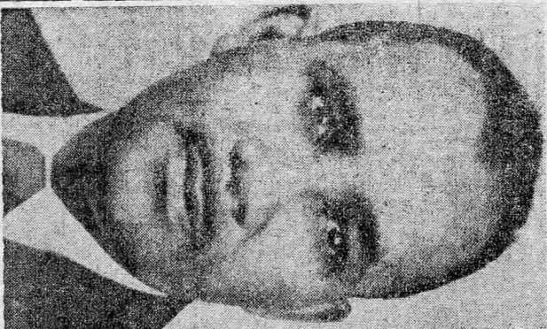
CLARENCE MITCHELL will speak in Jackson Sunday at a mass meeting to celebrate the ninth anniversary of the 1954 Supreme Court decision outlawing segregation in public schools. (See Page 3.)