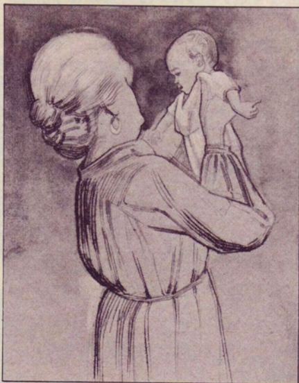
Hooked on kids: Odyssey operates a major program for addicted mothers.